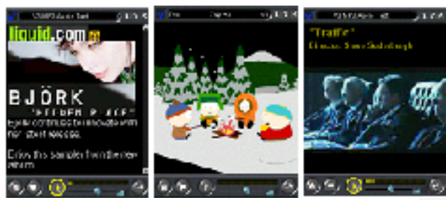
Actual PocketPC Screen Shots