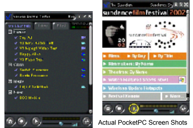
Actual PocketPC Screen Shots

FluxShow Platform can play practically any Flash file out on the web today with no modification whatsoever.