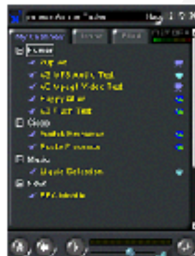
Actual PocketPC Screen Shots