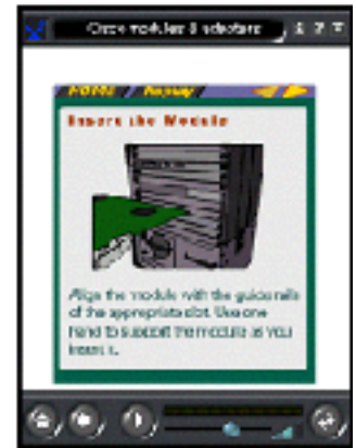
Actual PocketPC Screen Shots